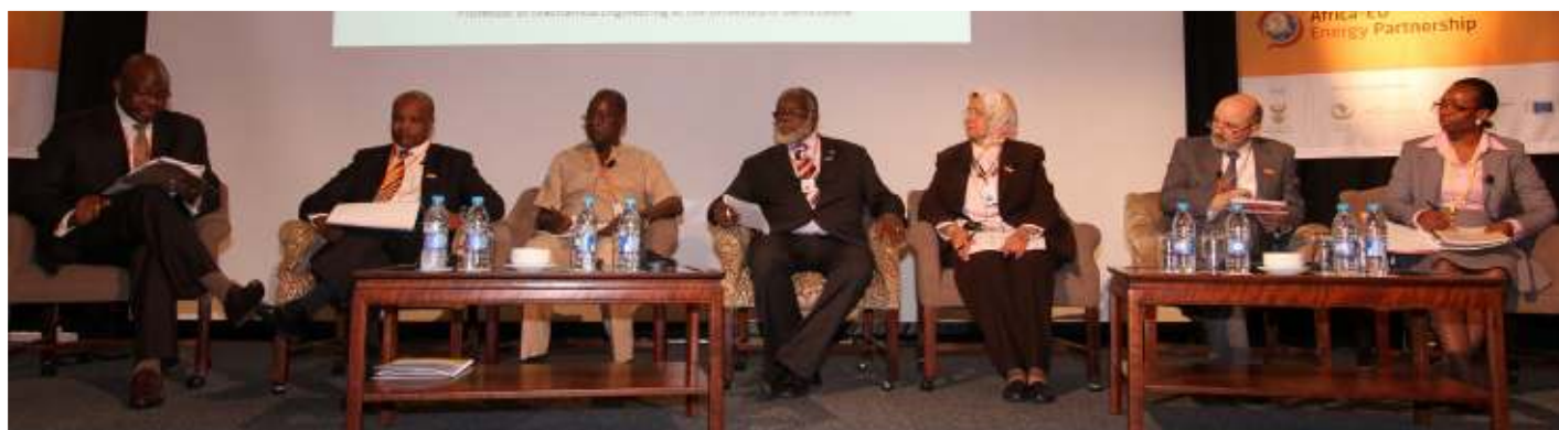
High-level representatives discuss the importance of cooperation between all stakeholder groups of the AEEP

AEEP Stakeholder Forum: The Second AEEP Stakeholder Forum will take place in 2014 and aims to bring together important members and representatives of the private sector, civil society, academia and financial institutions to jointly explore the potential of implementing "actions on the ground," as well as to discuss key issues and make recommendations to political decision makers. date: tbc location: tbc contact: AEEP Secretariat phone: +49-61-9679-6312 email: info@euei-pdf.org www: http://africa-eu-partnership.org/partnerships/energy