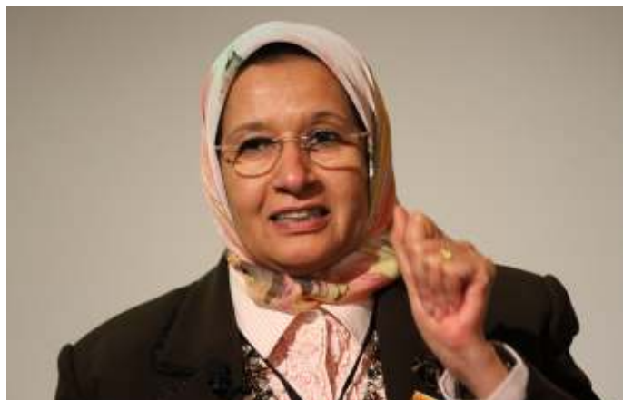
H.E. Dr Elham M.A. Ibrahim, Commissioner for Infrastructure and Energy of the African Union Commission welcomes the participants on behalf of the African co-chairs.

AEEP-HLM: The first High-Level Meeting (HLM) of the AEEP took place on 14-15 September 2010 in Vienna, Austria and addressed a number of themes. The HLM agreed on a set of concrete targets to be attained by 2020, grouped under six priority areas: energy access; energy security; renewable energy and energy efficiency; institutional capacity building; scaling up investment; and dialogue. Until 2020, the AEEP has committed itself to: ensure access to modern and sustainable energy services for at least an additional 100 million African