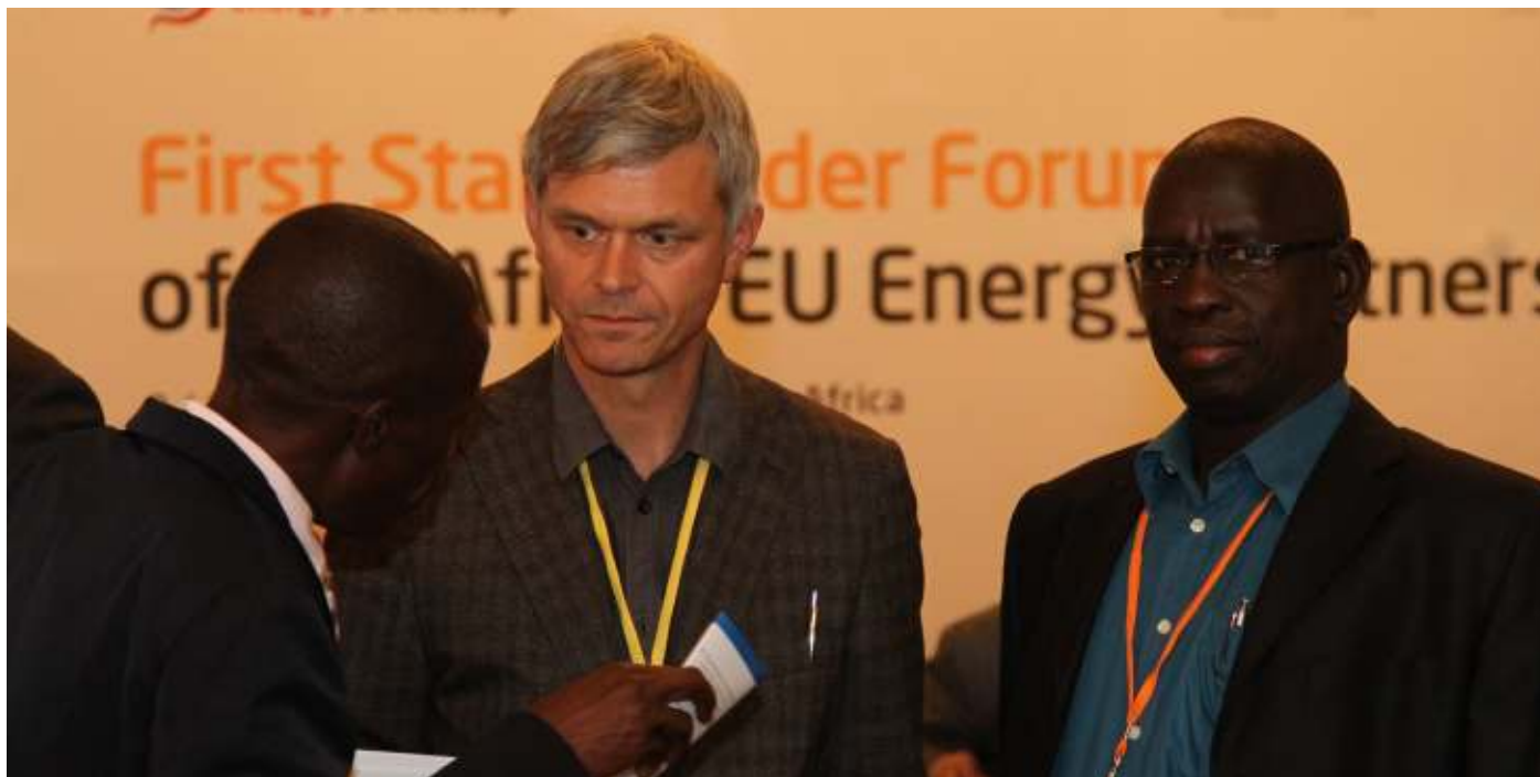
The AEEP Forum provided space for interaction between stakeholders from both continents, Africa and Europe