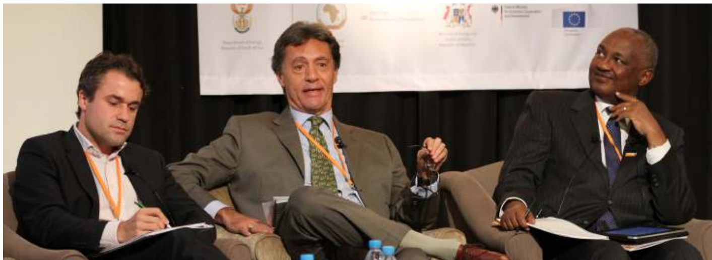
Some of the panelists during the Renewable Energy Business Roundtable "Making it Happen - Bringing the African and European Private Sectors Together"