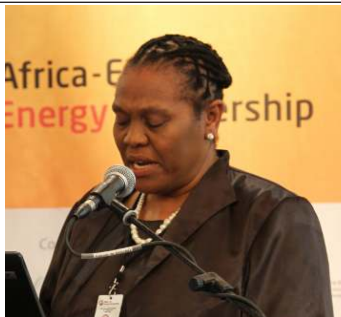
The South African Deputy Minister of Energy, H.E. Barbara Thompson , opens the First Stakeholder Forum of the AEEP on behalf of the host.

Africa and Europe have a shared interest in accelerating access to sustainable, efficient and secure energy supplies. Although it is endowed with abundant renewable energy resources, Africa requires significant technical and financial investments and capacity building to reduce its fossil fuel